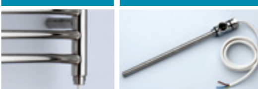
Electric only Dual Fuel Kits