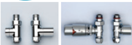
Solar Valves TRV's